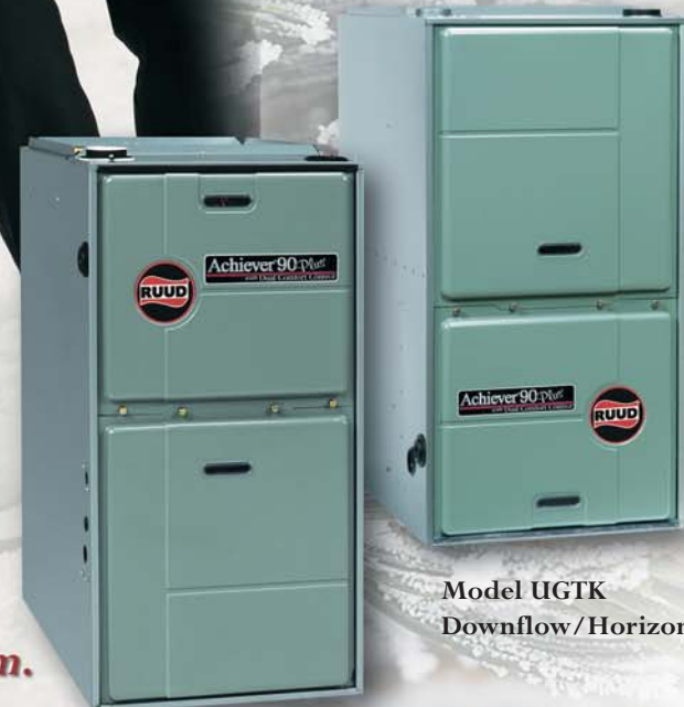
Model UGTK Downflow/Horizontal

ACHIEVER Series Premium 90 Plus Two-Stage Furnace with Dual Comfort Control